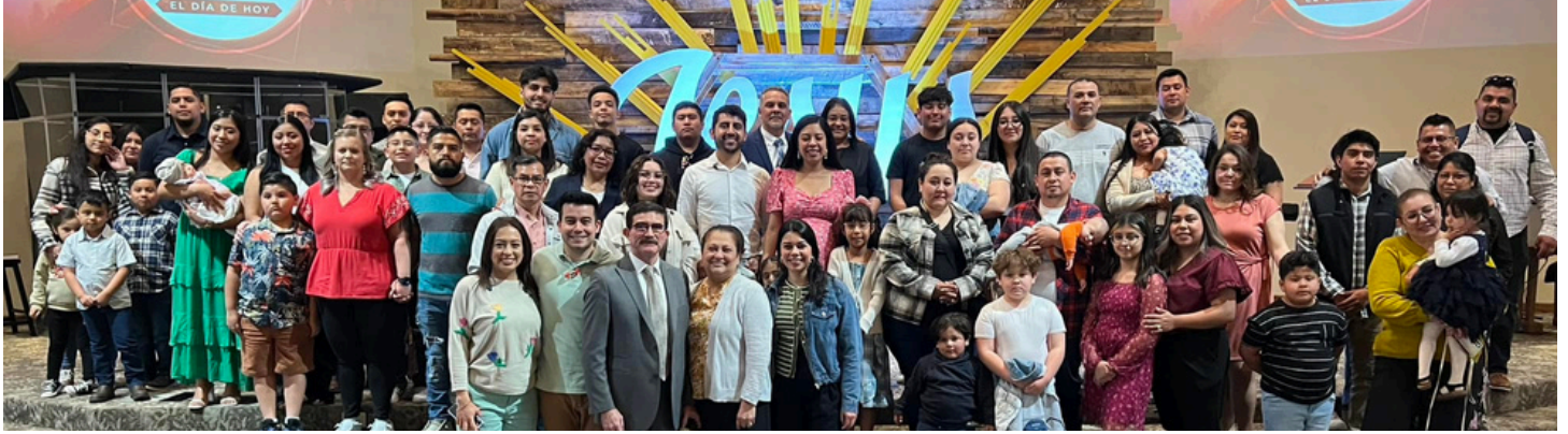
Shalom Hispanic officially organized as a church on April 21, 2024