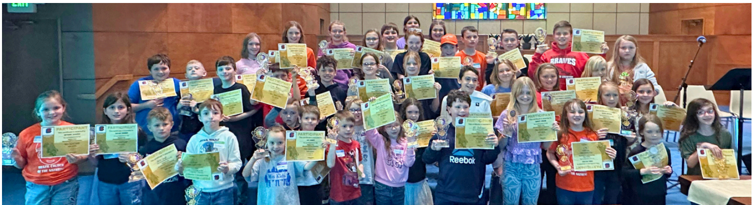
All District Kids Quiz @ Bloomington First